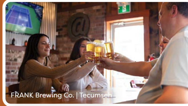
FRANK Brewing Co. | Tecumseh