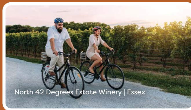
North 42 Degrees Estate Winery | Essex