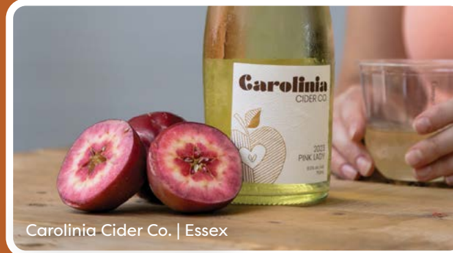
Carolina Cider Co. | Essex