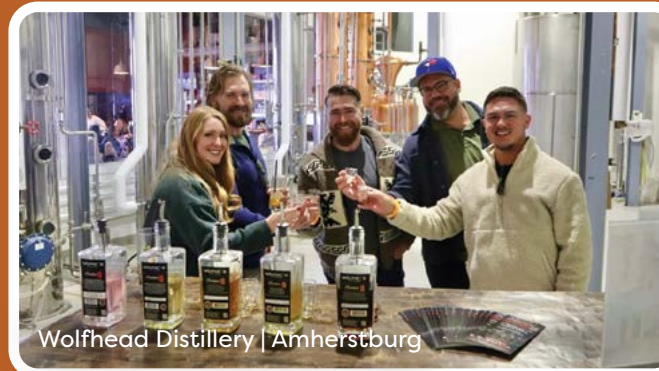
Wolfhead Distillery | Amherstburg